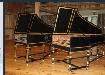
Left: Ioannes Ruckers Harpsichord (Antwerp, 1635) Right: Nicolas Dumont Harpsichord (Paris, c1700)