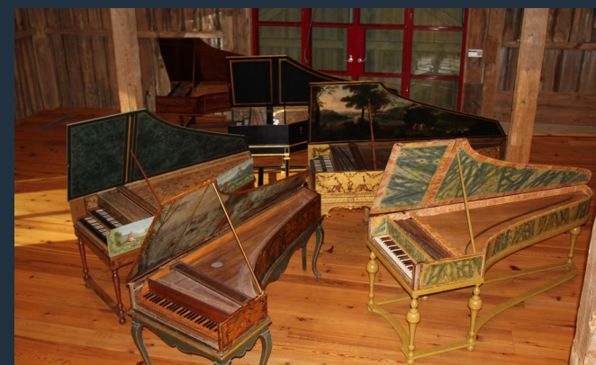
Clockwise, from bottom: Dominicus Pisarenensis Harpsichord, (Venice, 1570); Ioannes Ruckers Harpsichord (Antwerp, 1635); Jacobus et Abraham Kirckman Harpsichord, (London, 1779); Ioannes Ruckers Harpsichord (Antwerp, 1627); Harpsichord inscribed "Ioannes Ruckers me fecit, 1620"; Anonymous Harpsichord [Salamanca? c1730]